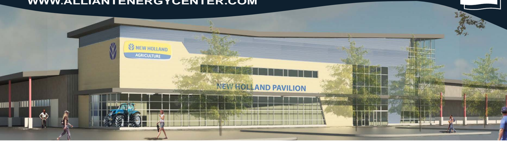
Pavilion #1 – 90,000 sq. ft.